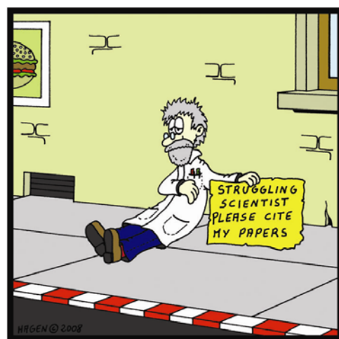
Figure 1. Vagrant scientist appeals to passers-by (drawing by Hegen).

The extent to which a published article is cited is considered by many to be a measure of the level of influence (impact) achieved by that article, and so the total or average number of citations achieved by individuals, journals and institutions may provide associated measures of overall scientific performance 18–21 . Each citation suggests the relevance of one article on another, although there may be other factors involved as well 22 . Of course, the original article may be perceived as supporting or inspiring or otherwise having a positive impact on the citing article, or as being contradictory or incorrect or otherwise viewed negatively by the citing article; either way it has had influence. The accumulated citations to a particular article therefore provide a measure of the total influence of that article 23 . It is not the only measure of such overall influence, but it is a simple and obvious one. It is therefore unsurprising that total and average counts of citations have increasingly been used as measures of overall scientific performance as computer-based